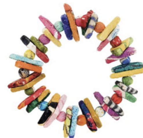
Kantha Paired Triangle Bracelet. WorldFinds. E1134