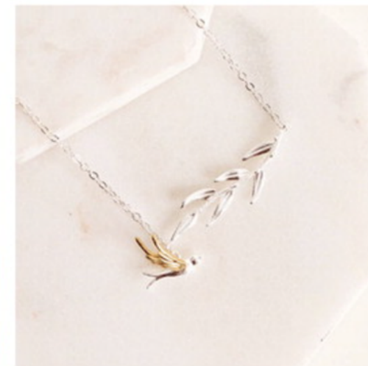
Bird and Leaves Necklace. Gratinsta. E111