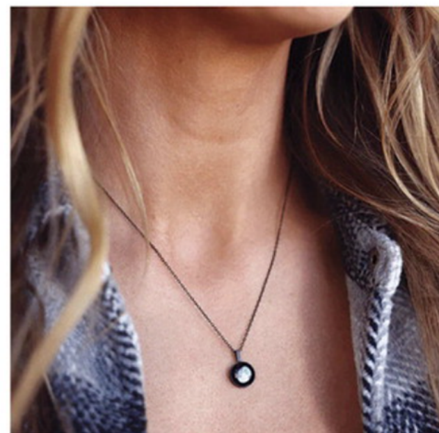
Nightfall Necklace. Moonglow Jewelry. E319