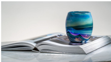
Dynasty Gallery is one of the 50 Market Snapshot Finalists.

GDA Staff // News & Commentary • August 11, 2020