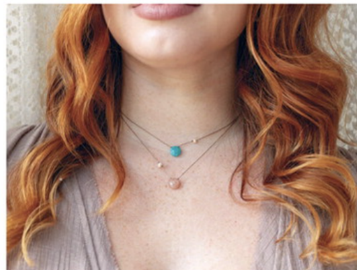
Goddess Collection. SoulKu. C1120 and C1125