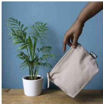
Carbon Neutral Makeup Bag, Terra Thread, $15 USD