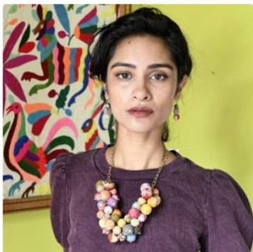
Repurposed Kantha Peony Necklace, WorldFinds, $38 USD