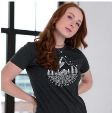
Let's Go Outside Eco-Triblend Tee, GOEX Apparel, $25 USD