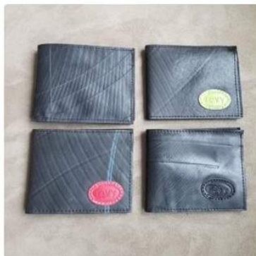
Reclaimed Inner-Tube Bi-Fold Wallet, Revy Fair Trade, $20 USD