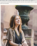
Wearing the Kashmir Heartbeat Sun Necklace , Upcycled Kashmir Pashas Scarf , Kashmir Heartbeat Bracelet , and Kashmir Heartbeat Bracelet .

Because they are handmade, every single piece is one-of-a-kind, making WorldFinds' jewelry pieces that you'll treasure for years to come.