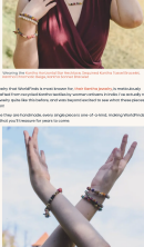
Wearing the Kashmir Heartbeat Sun Necklace , Upcycled Kashmir Pashas Scarf , Kashmir Heartbeat Bracelet , and Kashmir Heartbeat Bracelet .

There's simply no question that fair trade handmade pieces have a powerful purpose behind them and a deep, beautiful story worth sharing...and WorldFinds' jewelry pieces are the perfect illustration of this beauty and impact.