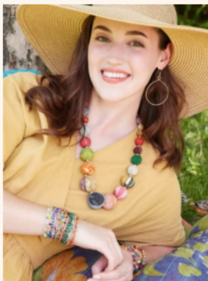
Kantha Graduated Bead Statement Necklace