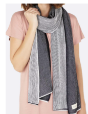
Cozy Knit Shoulder Wrap by Boody