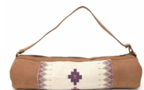
Iris Yoga Bag by MZ Fair Trade