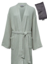
Waffle Bath Robe + Free Eye Pillow by Brightly