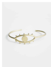
Eye to Eye Bangle by Mata Traders