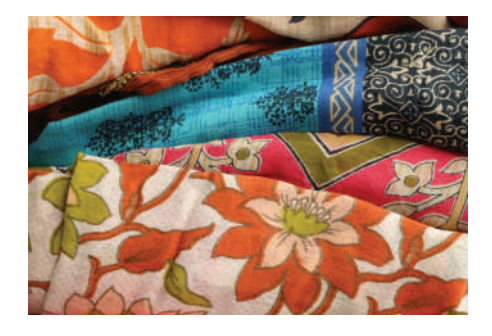
Discarded Sari & Kantha textiles are repurposed into our jewelry & accessories.